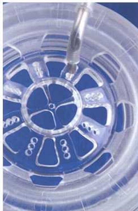
The OptiPoint template controls the angle, spacing and depth of applied CK points.

Dr. Milne has used the OptiPoint template as part of an ongoing clinical trial involving 124 eyes of 124 subjects. "Outcomes are now very consistent because we're doing a very reproducible procedure," he says. "When Dan Durrie and I did a large CK trial together in the past our outcomes were always about 0.25 D apart. With the template, we're within 0.01 D of each other at six months. This is extreme reproducibility. Furthermore, the three, six and nine-month data show that this gives a more stable, lasting result than the LightTouch method produced. In addition, the patients have had no complications, no change in contrast sensitivity, minimum induction of cylinder, and distance vision was preserved."